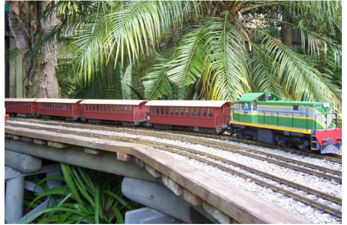
B Class passenger coaches with QR style curved roofs.

The models of B Class coaches behind the DH Class Loco.