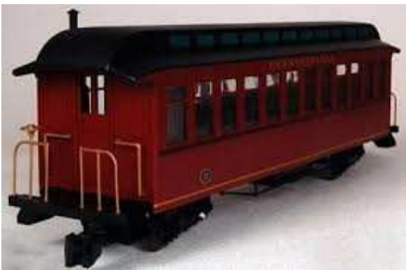
Bachmann passenger cars were reworked by replacing the Clerestory roofs.

These are slightly reworked Bachmann "Pennsylvanian" coaches with new roofs.