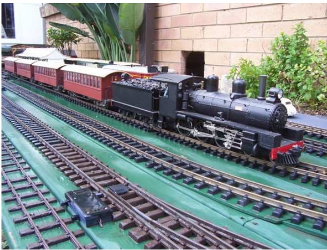
Keith Lindsay's PB15 and four B Class coaches.

The models of B Class coaches behind the DH Class Loco.